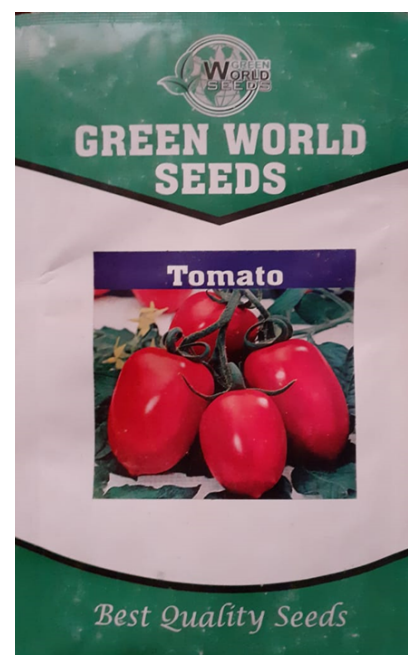
Supplementary Figure S2: Seeds of Roma tomato used in this study.